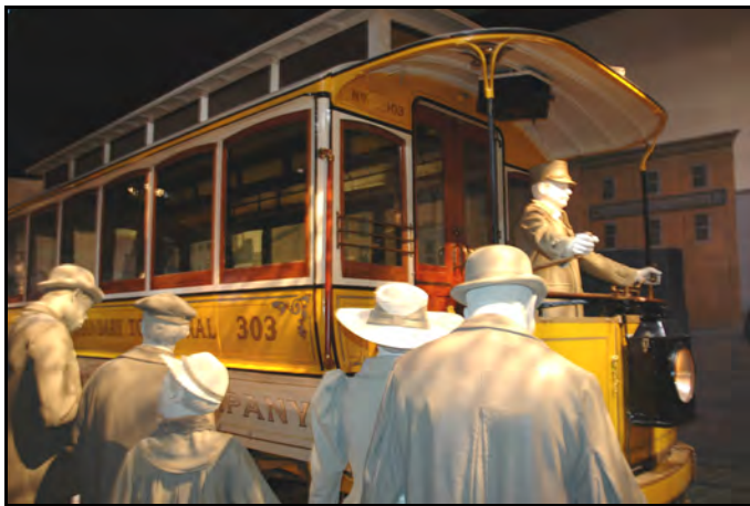
A Seventh Street streetcar on display in the America on the Move exhibit at the Smithsonian Institution's National Museum of American History.