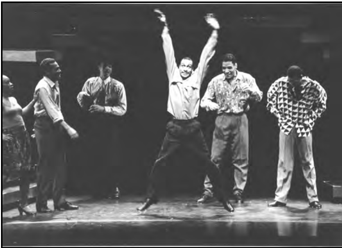
Where Eagles Fly opens at the Lincoln Theatre on March 30.