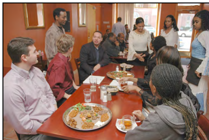
Queen of Sheba owners and staff greet customers during the restaurant's soft opening.